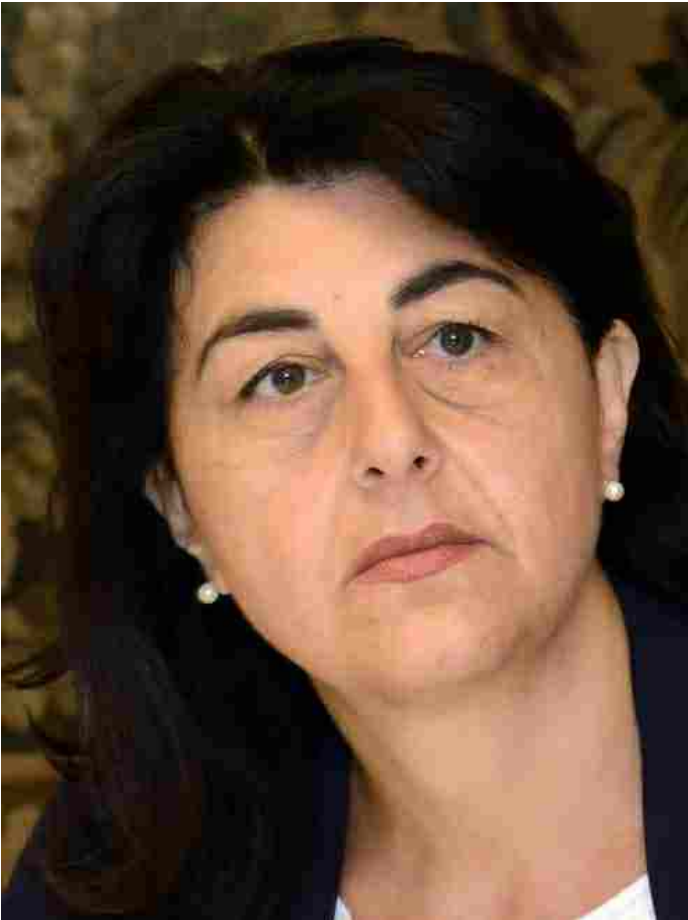
6 L q

FRVWLWXLWR LHUL D 3RUGHQRQH LO SULPR 7DYROR 7HUULWRULDOH SHU OD GHOOR DSSURYD JLRQH GHOOD 5LIRUPD GHOOR 3ROLWLFKH DELWDWLYH FRQ O $WWRUQR DO WDYROR LO SULPR D ULXQLUVL LQ UHJLRQH H FRRUGLQDWR GI UHJLRQDOH DOOH , QIUDVWUXWWXUH H 7HUULWRULR ODULDJUD JLD 6DQWRUR